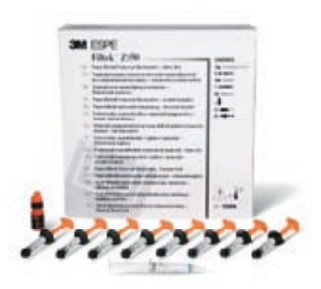
Filtek™ Z550 Nano Hybrid Universal Restorative Introductory Kit – Syringes (7050IK)

SYRINGE SHADE REFILLS include 1-4g syringe.