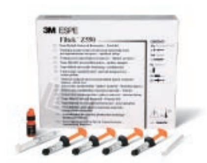
Filtek™ Z550 Nano Hybrid Universal Restorative Trial Kit – Syringes (7050TK)

Kit includes: 8–4g syringes: 1 each of shades A1, A2, A3, A3.5, B3, C2, D3, OA2; 1–6g vial Adper™ Single Bond 2 Adhesive; 1–3ml syringe Scotchbond™ Etchant; Accessories; Technique Guide; Instructions for Use